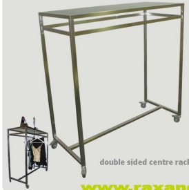
double sided centre rack