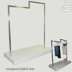
stepped ballet bar